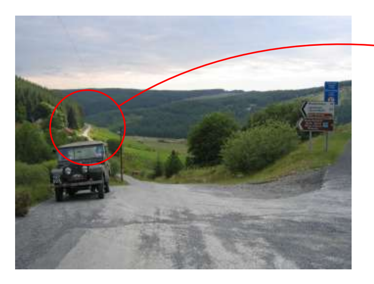
Nantyrhwch, northern end of the new Cwm Tywi road at T-junction with the Tregaron to Abergwesyn road \,