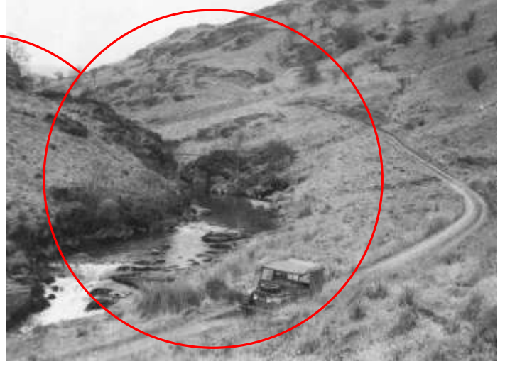
Location of Row & Lowrey's pin pointing shot in \textit{Cwm}\xspace Tywi, 30 March 1964