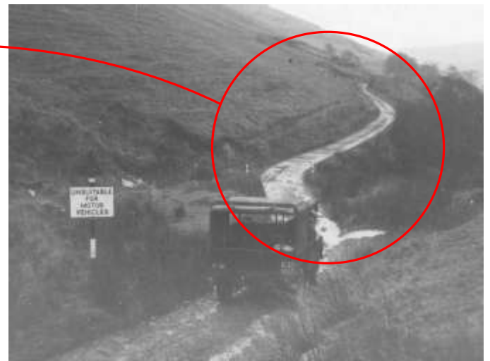
The track before Llyn Brianne was constructed 28 December 1963