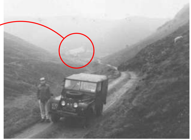
Above Troed Rhiw heading for Llyn Brianne