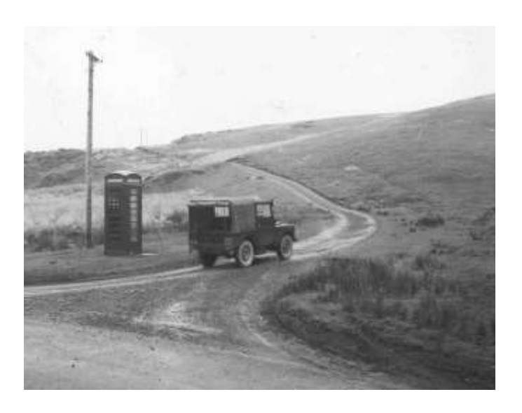
Tregaron 262 28 December 1963