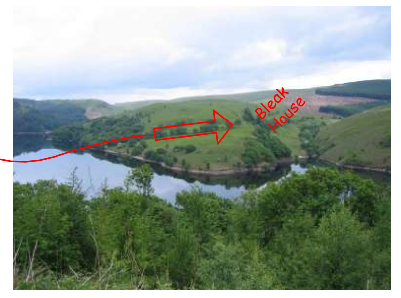
North east across Llyn Brianne to Bleak House